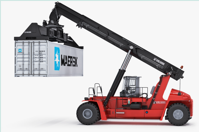
Reach Stacker Year of Manufacture: 2015