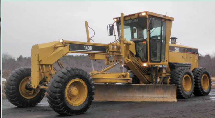
Motor Grader Year of Manufacture: 2015