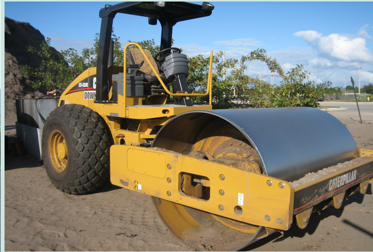
Vibrator Roller Year of Manufacture: 2015