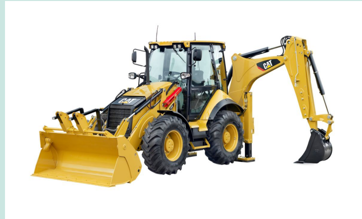
BackHoe Loader Year of Manufacture: 2015