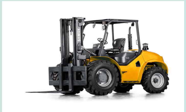
Rough Terrain Forklift Year of Manufacture: 2011