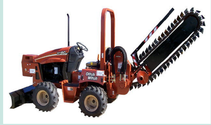
Trencher Year of Manufacture: 2015