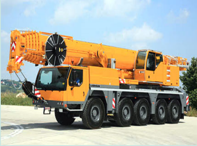
All Terrain Crane Year of Manufacture: 2008