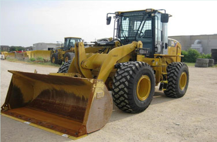
Front End Loader Year of Manufacture: 2015