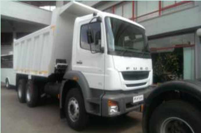
Dump Truck Year of Manufacture: 2015