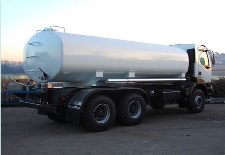
Water Distribution Truck Year of Manufacture: 2015