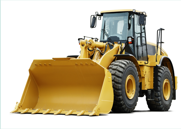
Bull Dozer Year of Manufacture: 2015