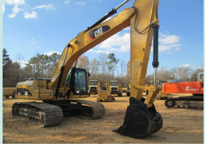
Tracked Excavator Year of Manufacture: 2015